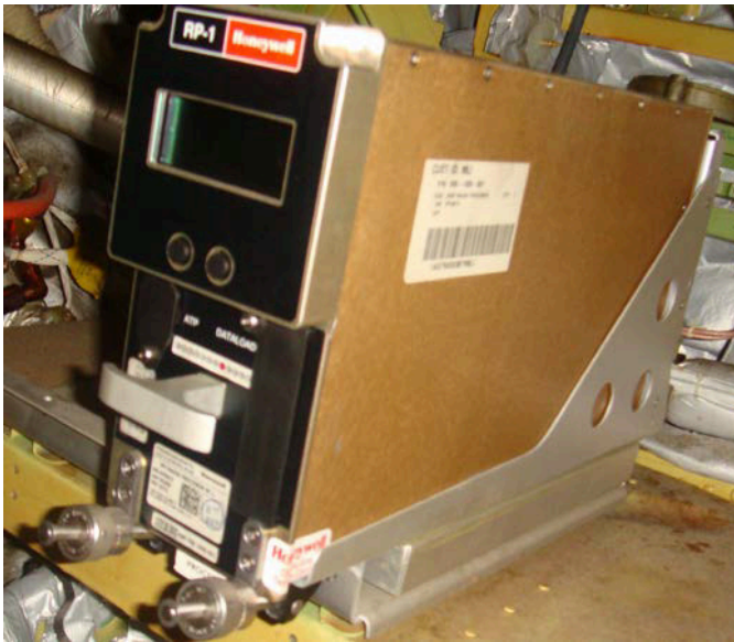
WXR Processor after Modification