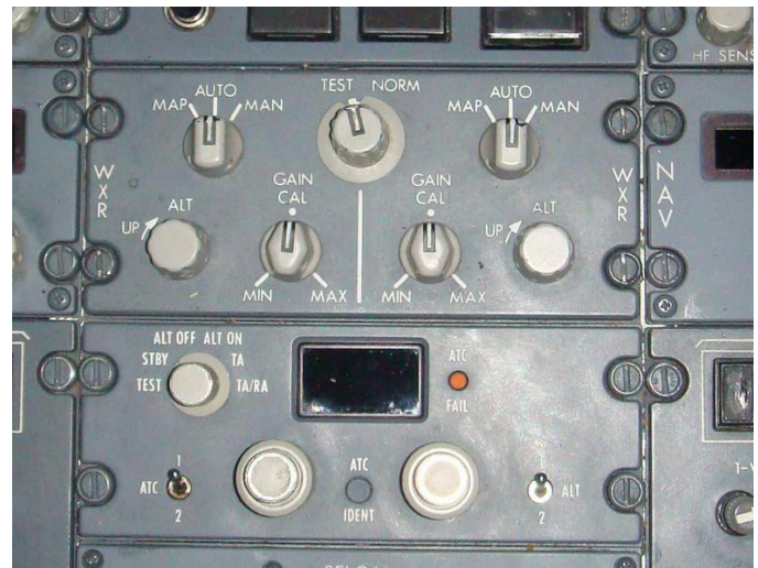
WXR Control Panel after Modification